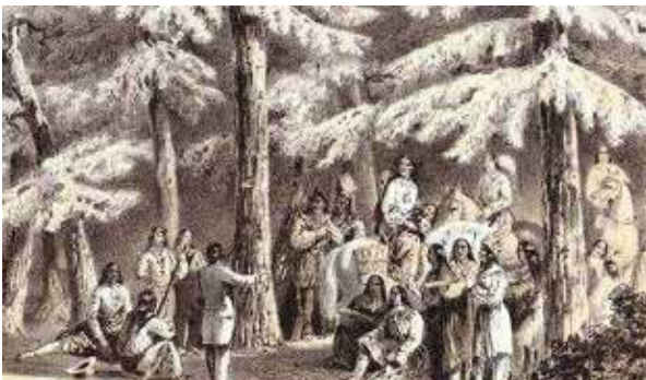
Detail from "Nez Percés" by John Mix Stanley. This picture, created in October of 1853, displays a meeting between Isaac Stevens' railroad survey team and a hunting band of Nez Percé Indians.

Unfavorable living conditions in the rest of the United States also encouraged many people to choose to immigrate to Oregon Territory. In the Mississippi Valley, for example, nearly ten years of hard times began in 1837. Bad weather and widespread sickness worsened living conditions already made difficult by economic depression.