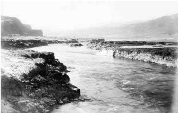
This picture of the Dalles, taken by Asahel Curtis in 1916, shows the Dalles as it was before the Dalles Dam. It was once a series of waterfalls twelve miles long, with its head, Celilo Falls having a 20 foot drop. Courtesy Washington State Historical Society.

However, the U.S.-Indian treaties of 1854 through 1856 left Indian tribes with only a small part of their former homelands. Tribes gave up millions of acres in Washington Territory alone, in exchange for a guarantee or promise that their rights would be protected, that some lands would be reserved, and that many goods and services would be provided for them by the U.S. Government.